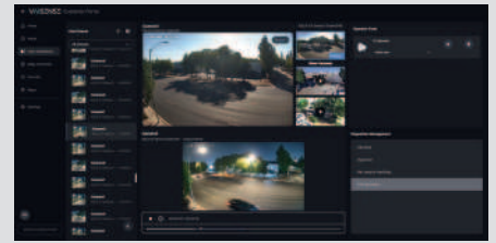
Alert Operation Integrated with Response Ready Respond to threats with one click.