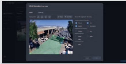
AI Detection Zone Define priority monitoring areas to reduce false alarms.