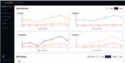
Tailored Fit Dashboard Measure important alert statistics including intrusions, safety hazards, and altercations.