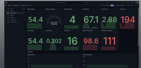
Solar Battery Health Management Monitor electricity generation, storage, and usage in real time from any location.